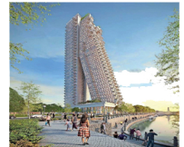
Altair Residential Building, Colombo Location : Colombo, Sri Lanka