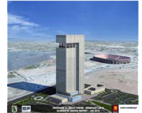
Al Fatah Tower, Benghazi Location : Benghazi, Libya