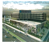
Kings College Hospital, Jeddah Location : Riyadh, KSA