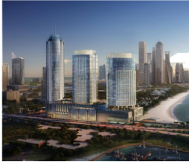
Construction of Palm Gateway Location : Dubai, UAE