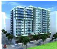
Polagahwella Water Supply Project Location : Colombo, Sri Lanka