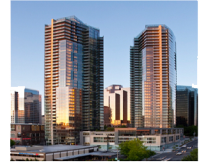
Bellevue Towers Location : Dubai, UAE