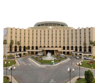
Makarem Hotel - Design Location : Riyadh, KSA