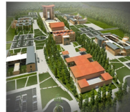
Construction of the University of Gamb.. Location : Ghana, Ghana and West Africa