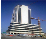
Al Sharief HQ Location : Doha, Qatar