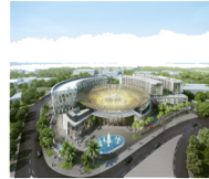
IPA - Institute of Public Administration Location : Muscat, Oman