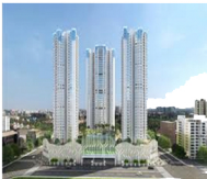
Tripoli Gate, Tripoli Location : Tripoli, Libya