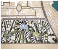
Mayasseh Development Phase 1 Location : Riyadh, KSA