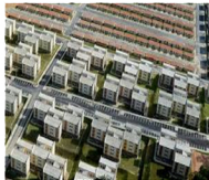
Mass Housing Location : Ghana, Ghana and West Africa