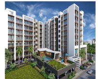
Design and Build of 2090 Apartments a.. Location : Algeria, Algeria