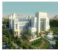
ROPH Location : Muscat, Oman