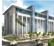
Pharmacy Collage - Qatar University Location : Doha, Qatar