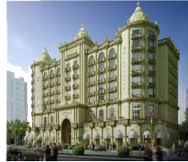
Construction of Le Boulevard, Doha Location : Doha, Qatar