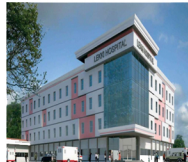
Admiral Care Hospital, Lagos, Nigeria Location : Nigeria, Nigeria