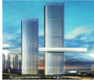
One Zabeel Location : Dubai, UAE