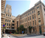
Gozo General Hospital Location : Malta, Malta