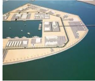
Construction of New Port Project, Doha Location : Doha, Qatar