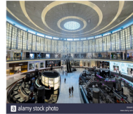
The Dubai Mall - Fashion Avenue Dome Location : Dubai, UAE