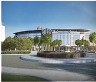
Warner Bros. Hotel Location : Abu Dhabi, UAE