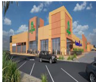
My City Center Location : Muscat, Oman